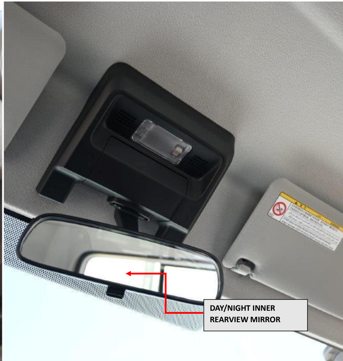
DAY/NIGHT INNER REARVIEW MIRROR